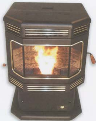
P2700 Standard Shown with optional brick panels