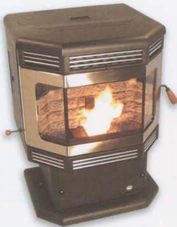
P2700 Deluxe Brushed Nickel Shown with optional brick panels

Light weight fly ash is easily removed from a large, built-in ash drawer on freestanding models. Heat exchange tubes are cleaned with a conveniently located push/pull rod.